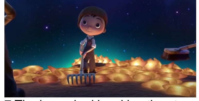
7. The boy raked is raking the stars up into a crescent moon shape.