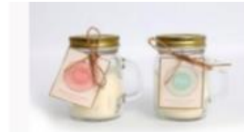
Festival Vibe Mason Jar Candle - Small

All orders must be in school with money/online payments made by Friday 4th December 2020. These are just a few of the gifts available.